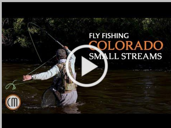
Small Creek Fishing - Colorado