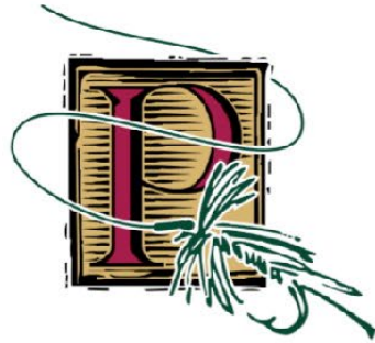
St. Peter's Fly Shop