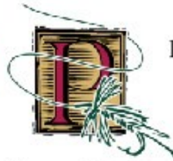
St. Peter's Fly Shop