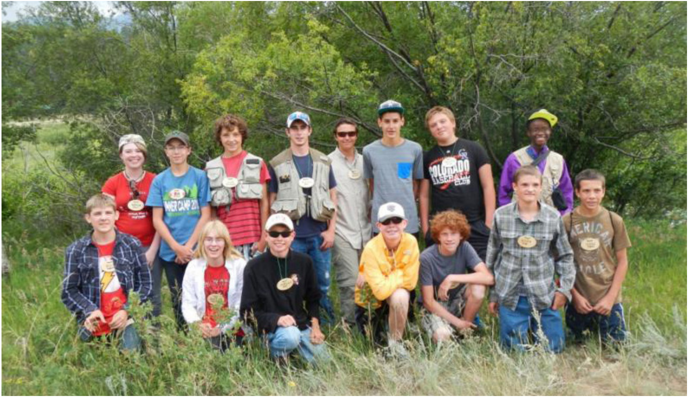
2013 RMF Youth Day Camp Participants

It's not necessary to commit to participate for the entire week; just those you can fit into your calendar and for which you have at least average skills. Instruction details are provided to volunteers for each activity, and leadership oversight is also provided at each activity.