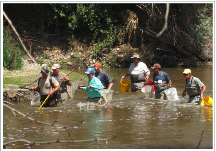
Day Camp 2014: Electro-Fishing

outstanding 2015 Youth Day Camp. The daily activities that require the largest volunteer mentors groups are outlined in the grid below...and signing up is easy!