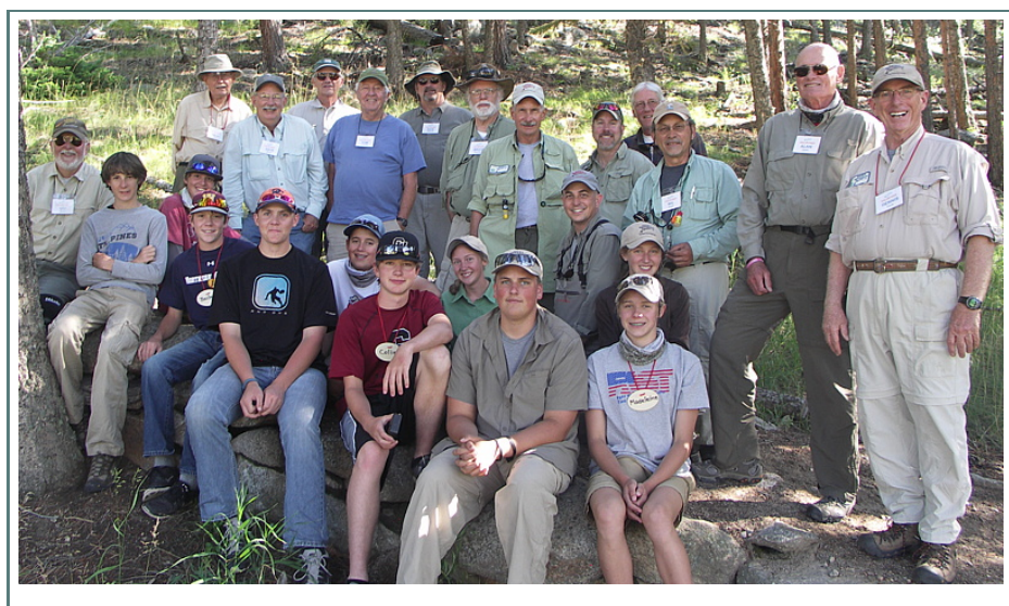
2014 RMF Day Camp Graduates and Mentors

Mentor Volunteers! You can sign up now to ensure you don't miss being part of RMF's