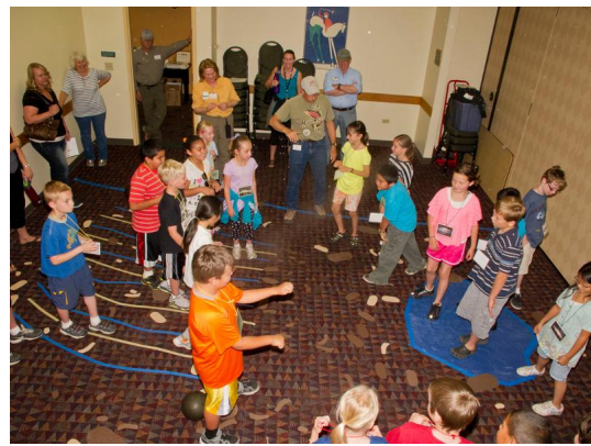
Trout awaiting the insects swept downstream

An interactive program was presented to seven different classes totaling 165 energetic 3rd graders who learned about the dynamics and life cycles that occur in a healthy stream environment. To make the learning fun, a game format was used to teach simplified interactions between common stream and riparian inhabitants. The children were divided into 3 groups -aquatic insects, trout, and predators - each identified by a pictorial neck tag. When the water in the stream, depicted by blue tape on the floor began to flow, the insects were "eaten" by the trout who were then "eaten" by the predators. A discussion followed about how a portion of the insects and trout find shelter, lay eggs, and produce nymphs and fry to perpetuate the cycle. We quickly discovered that the third grader aquatic insects and trout were quite creative at avoiding being "eaten". It appeared that the volunteers had as much fun as the kids did.