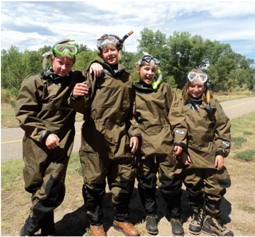
Campers snorkel to examine underwater habitat