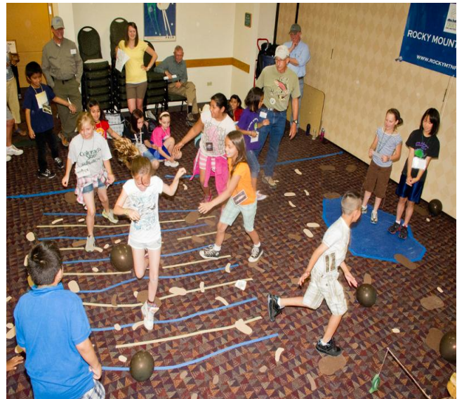
The "who eats who scramble"