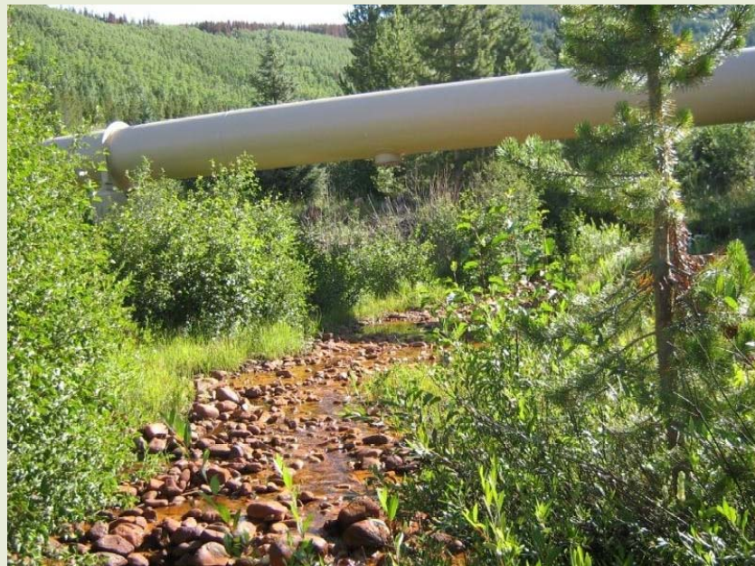
Jim Creek at the Fraser River canal pipeline

If Ike were to posthumously visit to the Fraser River today, here is one of the sights he would see.