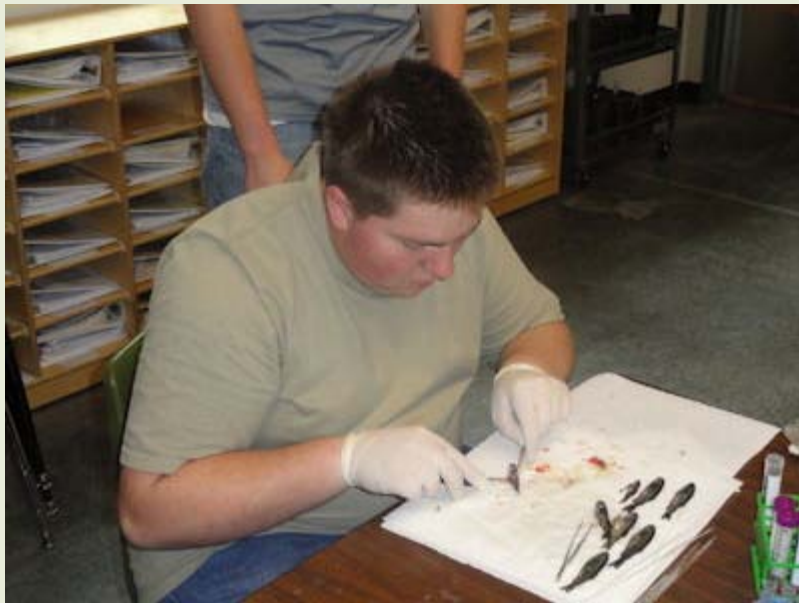
Dissecting and collecting tissue samples