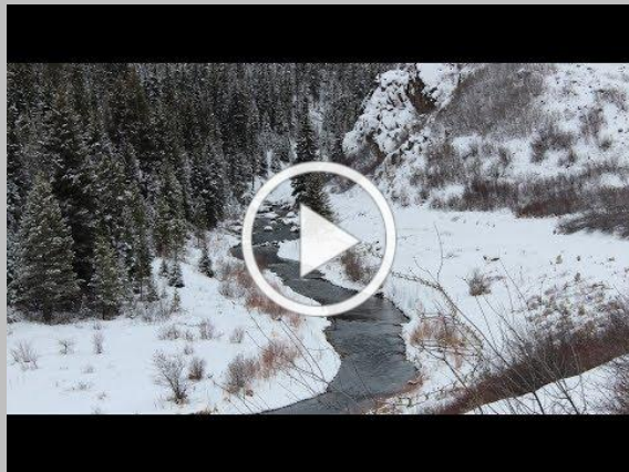
Winter Trout Fishing in Colorado